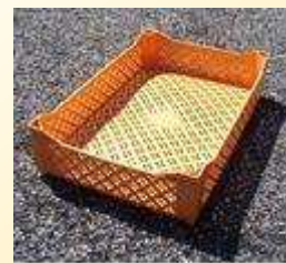
open-weave tray with raised corners