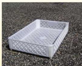
Open-weave tray without raised corners