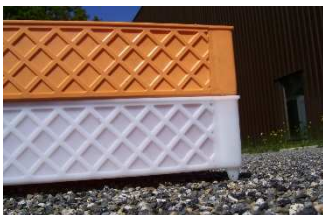
Solid trays without raised corners

Range of products with same dimensions :